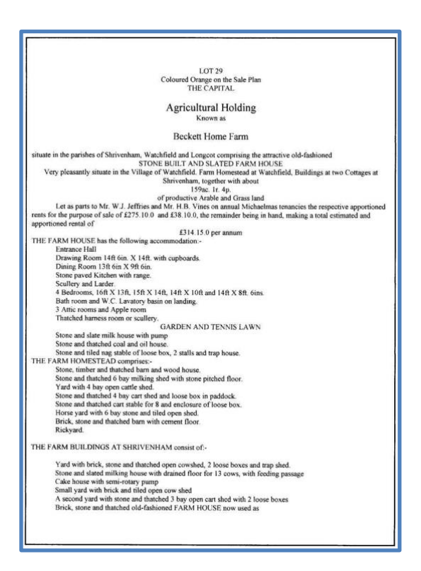
Below. Beckett Home Farm, now the Grange on the High Street