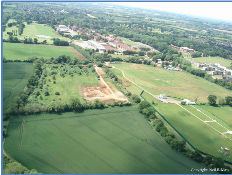
Above. What remains of Homeleaze Farm today is in the top right