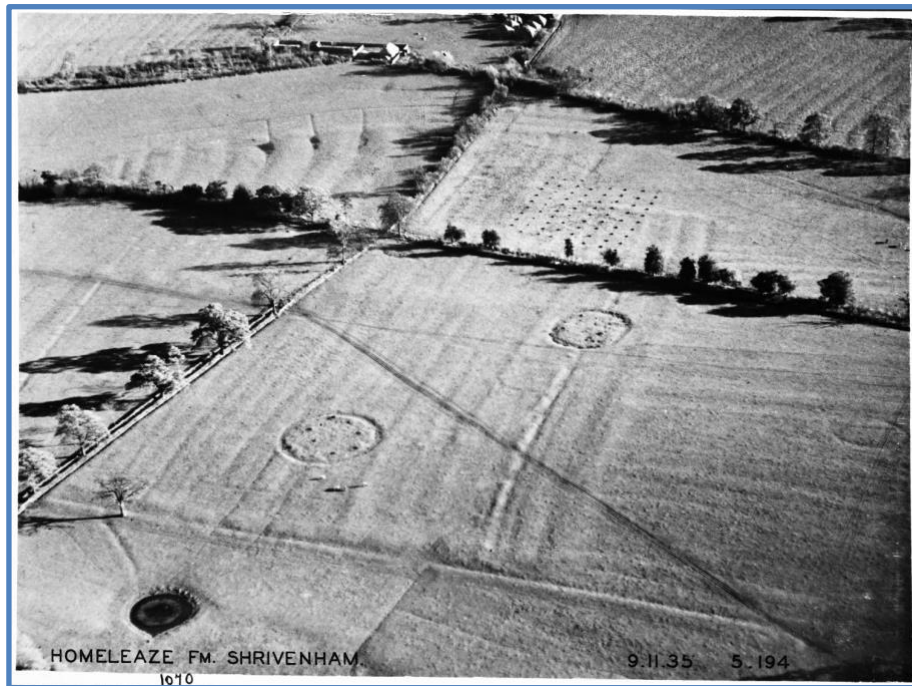
Dated 9/11/1935. The edge of Broad Leaze Farm is in the top left. Photo courtesy of Ashmolean Museum Picture Library, Allen Aerial Photo Archive AA809. Neg AA1070