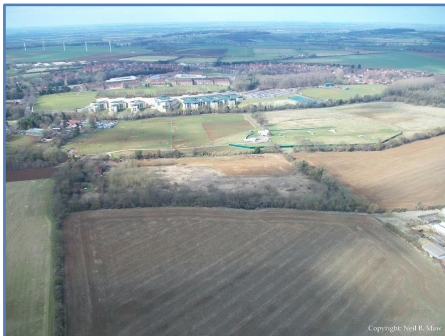
Above. The area as it is today. Broad Leaze is in the bottom right